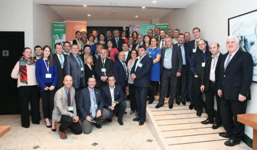
Regional seminar “on Citizen participation: an essential tool in local democracy”, Chisinau, Moldova, 16 – 17 November 2016.