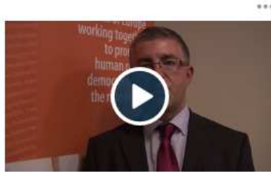
MOLDOVA: strengthening the efficiency of the judicial system and support to lawyers' profession