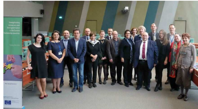
Second meeting of the ‘Community of Practice on local democracy in the Eastern Partnership Countries’. Strasbourg, 14-15 November 2016