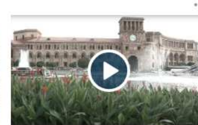
ARMENIA: Supporting criminal justice reform and combatting ill-treatment