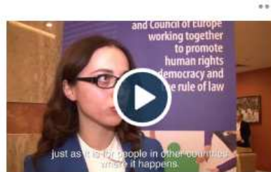
GEORGIA: Combating money-laundering and terrorism financing