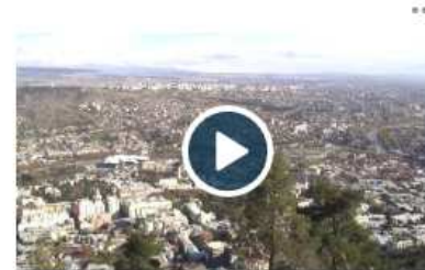
GEORGIA: overview of 8 EU/CoE cooperation projects